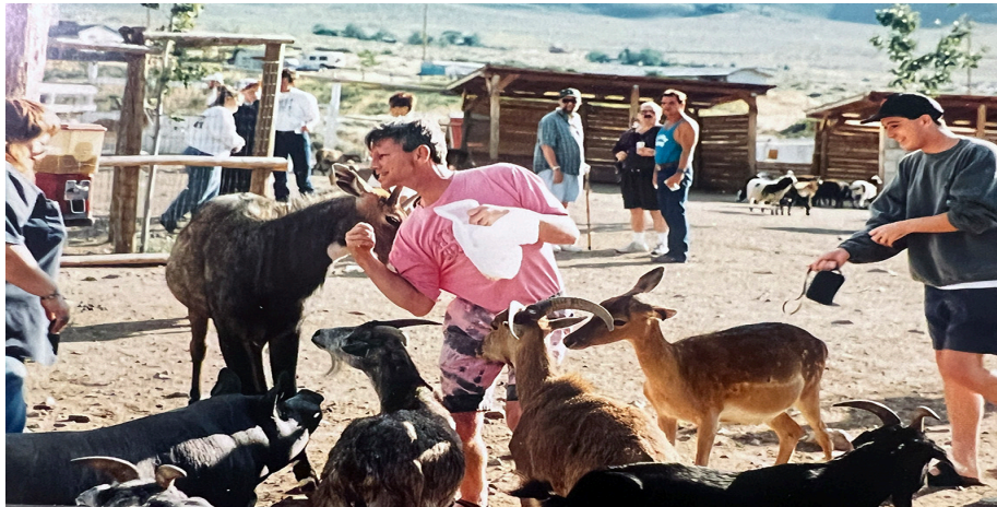
The Petting Zoo section at Sierra Safari Zoo on Gay Night