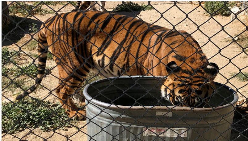
One of the parks tigers takes drink