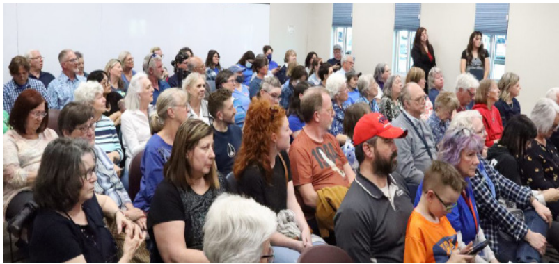
It was standing room only at the Spanish Springs Library for the Board meeting

The Washoe County Library Board's meeting lasted nearly six hours on April 17 with the board supporting its staff's recommendation not to remove from general circulation a list of books far right Republicans challenged. The board voted 4 to 1 in support of the staff recommendation to not reclassify.