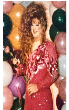
2002 Closet Ball Queen Bublicious

There is no gender requirement, so it is open to all.