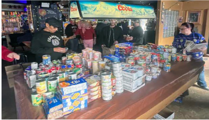
Sorted and ready to be boxed up are cans of food donated to the Northern Nevada Food Drive

The Silver Dollar Court, the oldest LGBTQ organization in the State of Nevada, teamed with Northern Nevada HOPES to bring back the Northern Nevada Food Drive November 11 to December 24.