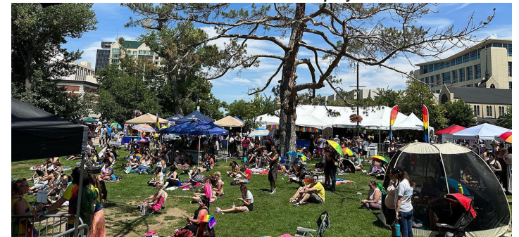
The area in front of the Glenn Little Amphitheater stage, presented this year by Anthem.