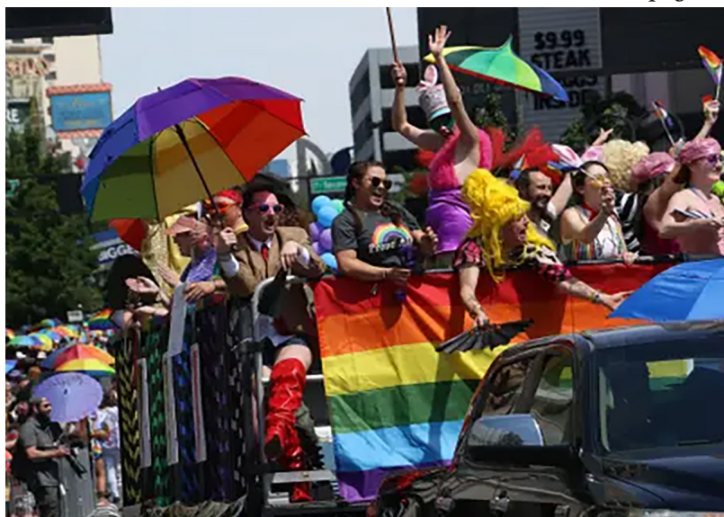
One of the floats an organization entered into the community Pride Parade celebrating the community's diversity