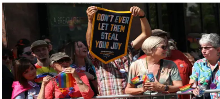
Along the parade route on Virginia Street (Reno's Main Street) there were rainbows everywhere spreading Joy and community spirit