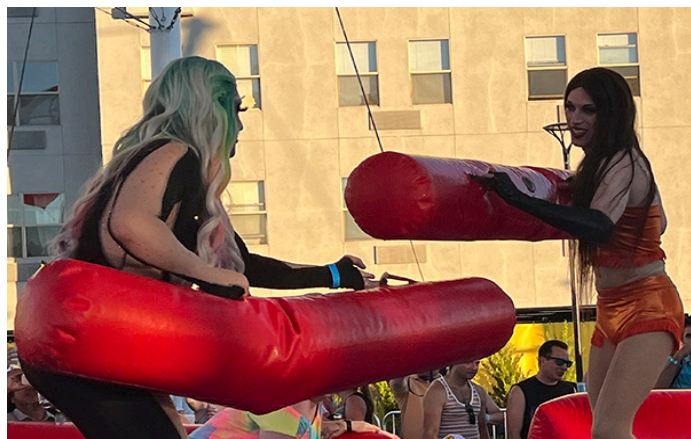
Two of the drag queen contestants take to the jousting event.

Then the competition began in events like: Bungee Race, Luggage Cart Luge, Happy Hippo, Musical chairs, Jousting and Bear Wrestling.