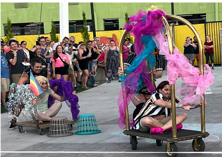
The Bellcart Luge pits two teams against each other as they travel a path through several obstacles to the finish line