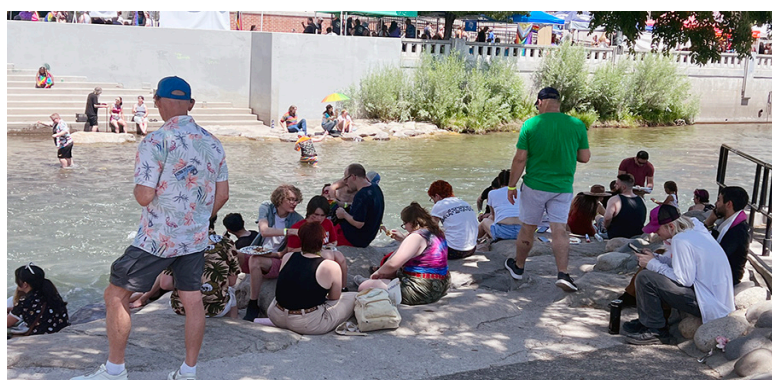
As the temperature climbed during Pride celebration in Wingfield Park, surrounded by the Truckee River, festival goers found relief

Rainbows filled the downtown area of the Biggest Little City in celebration of local