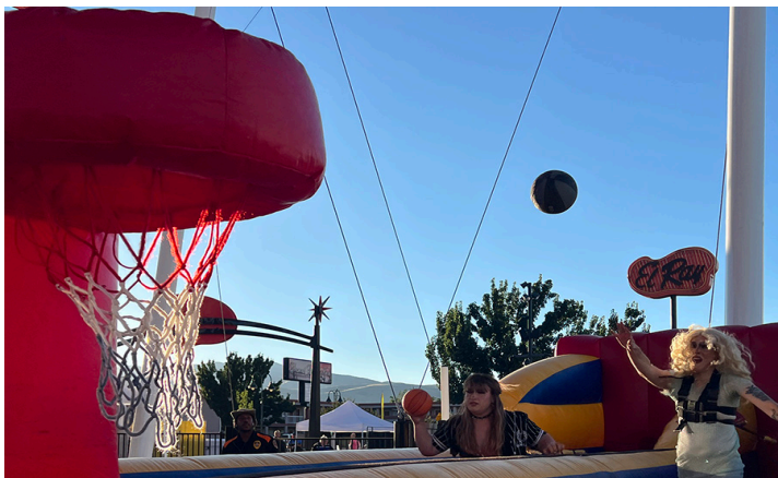
The Bungee Race was changed due to Covid to a basketball throw. Each contestant is in bungee harness trying to hit the basket

The event is a competition between teams of two composed of a Drag Queen and a Drag King or audience volunteer.