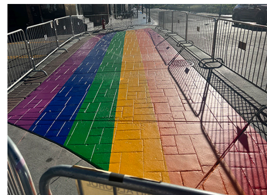
The freshly painted infamous Reno Rainbow crosswalk under the Reno Arch celebrating Pride