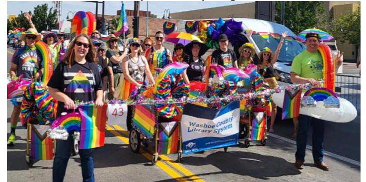
Washoe County Library staff decked out for Pride as a marching float