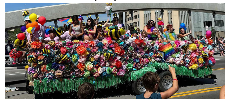
The Northern Nevada Hopes float in the parade