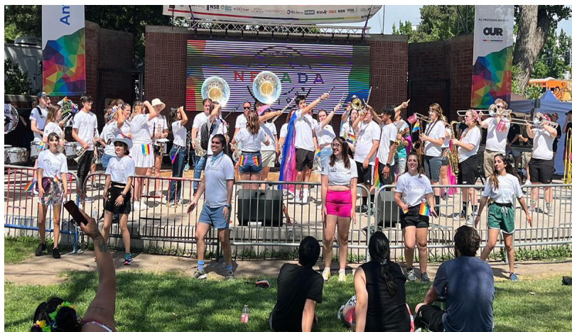
The Nevada Marching Northern Nevada Pride Band performs at Pride

The temperature reached 105 on Saturday July 22 as Northern Nevada celebrated the rainbow at the Northern Nevada Pride Festival and community Pride Parade in downtown Reno. But that didn't keep nearly 15,000 people from the festivities.