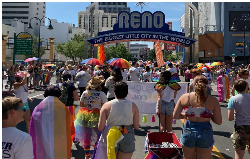
Parade participants head under the iconic Reno Arch in the parade