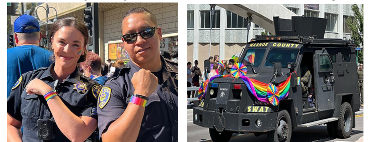
Reno PD and Washoe Co. Sheriff displayed the rainbow