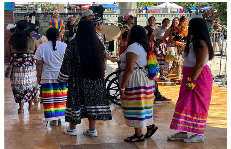
Members of the Pyramid Lake Paiute Tribe perform a Blessing of the Land ritual as part of the opening ceremonies