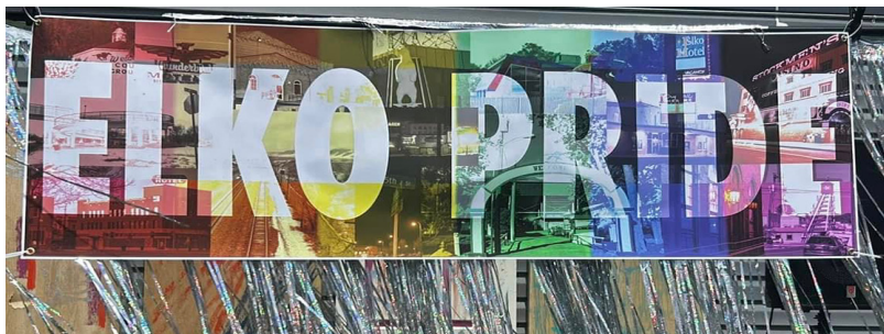
Elko Pride had a photo area for attendees to get a picture under