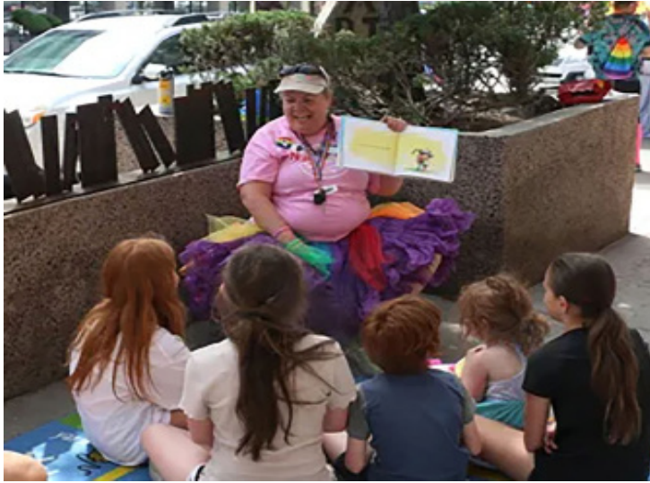
The pop-up outdoor Story Time in front of the main library

Many times the "modern day" LGBTQ community forgets the best defense against the hate is to be non confrontational. Not react to the yelling and screaming and hateful things being