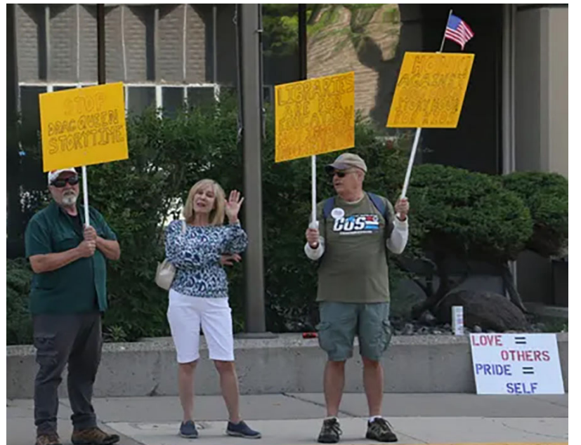
The across the street protestors who protested against reading to children