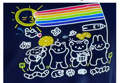
The Northern Nevada Pride 2023 t-shirt

All proceeds from Northern Nevada Pride Festival and Community Pride parade benefit the local LGBTQ Community Center, OUR Center. This is the biggest fund raiser of the year from the organization. The Center offers the LGBTQ commu-