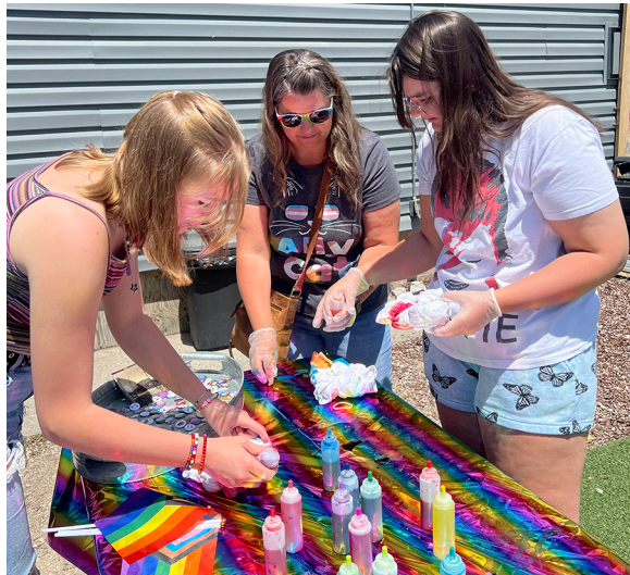
A creative fund raiser by the Elko Pride group to raise funds to help them become a 501(c)3

In 2015 and 2016 Elko held two pride events with a parade and small festival, but the person behind the event left the area. Elko now has a Pride groups that ha hosted three small Pride events and is planning more and to expand in the future. Elko Pride runs a Facebook page: Elko Pride and also an Instagram page. Information and activities can be found on these pages about Elko Pride.