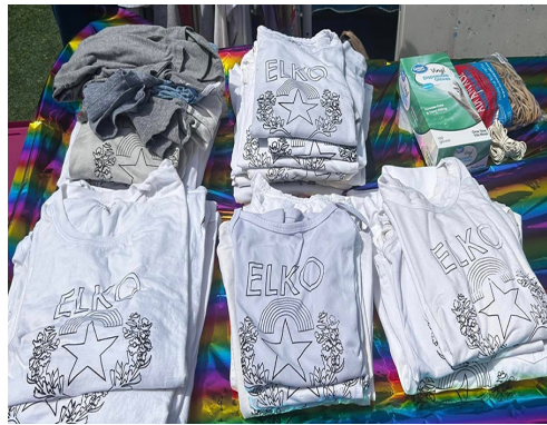
Elko Pride's fund raiser handmade swag t-shirts patrons got to tie-dye