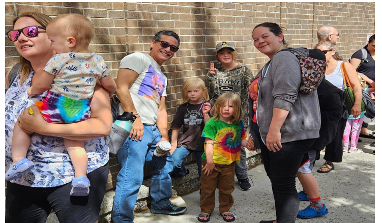
The crowd in front of the downtown library demonstrates the popularity of the Washoe County Libraries Drag Queen Story (Hour) Time.