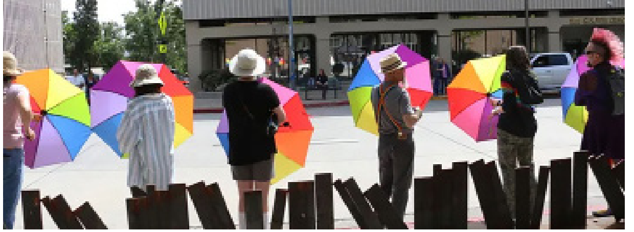
Members of the Rainbow (Umbrella) Brigade shield those in line for Story Time from protestors' potential rants and raves

A drag queen is simply an entertainer, nothing more. They are usually flamboyant and over the top in performances. But at story time they simply read to children