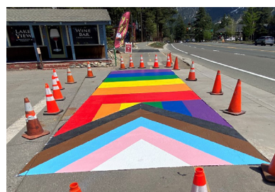
The South Lake Tahoe, CA Pride crosswalk

The local Grand Daddy of Pride celebrations is Northern Nevada Pride Festival and Community Pride Parade in Reno. July 22 is the date for this year's