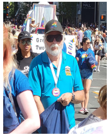
Passing out candy along the parade by City of Reno

Wingfield Park may not be available for future Prides as the Arlington Bridge will be replaced over a two year period causing the Pride celebration to be relocated. Northern Nevada Pride is in discussions for a new site.