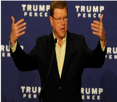
Congressman Mark Amodei

The District Two United States Congressional seat, which covers most of northern Nevada including Reno, is held by Republican Mark Amodei, who on July 19 voted against a bill that would extend federal protection for same-gender and interracial marriages.