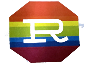
2019 Recipient of the City of Reno Mayor's Rainbow R Award for Outstanding Service and contributions to the LGBTQ Community