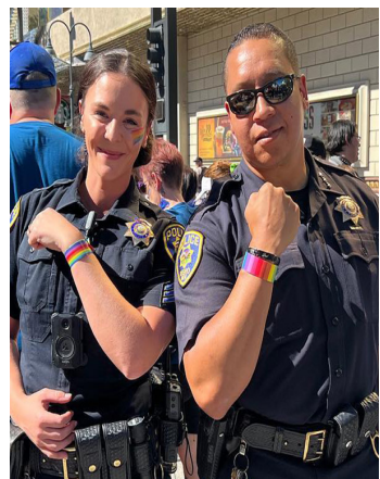
Members of the Reno Police Dept. sporting the rainbow