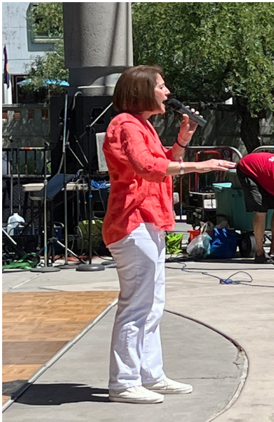
Nevada US Senator Catherine Cortez-Mastro address the crowd

Also something new to the festival this year was a gate charge of $5. Northern Nevada Pride decided to have the gate fee due to the large increase in expenditures the event encountered due to changes by the City of Reno and Washoe County Health Department. Previously, Pride attendees were simply asked to donate at the gate.