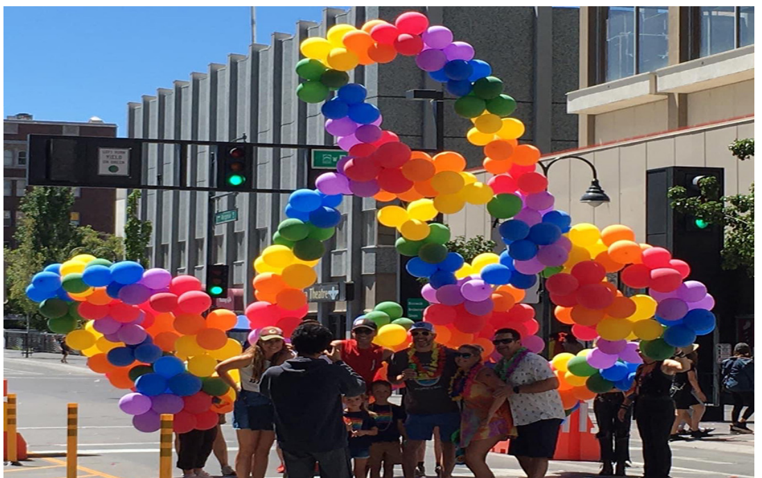
The Rainbow Balloon Arch a symbol of Northern Nevada Pride is being launched to lead the Parade on Virginia Street in the Heart of Downtown Reno

first held in the Truckee Meadows in June 1987 in a secluded out of the way park along the Truckee River in Sparks. The group promoting it disbanded and the event became the All Community Picnic.