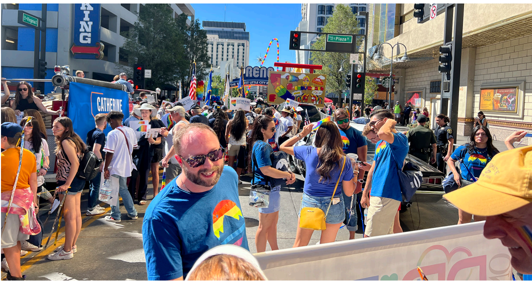
The assembly area for the start of the 11th annual COMMUNITY Pride Parade