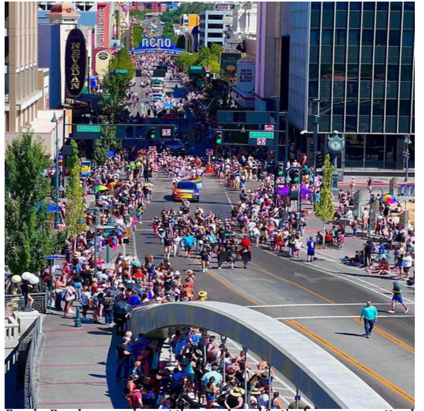
People, People everywhere at the parade and festival as 20,000+ attend