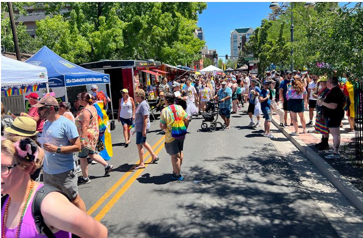
Activity on the additional space added to Pride - West First Street