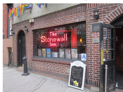
The Stonewall Inn in New York City is on the National Register of Historical Places

Stonewall Inn, the site of the infamous Stonewall Riots in June 1969, credited as the birthplace of the modern GLBTQ civil rights movement, was recently designated a Place of National Historical significance and made a National Landmark through the National Parks Services Heritage Initiative. The Initiative was designed to locate places of national historical significance for the underserved communities like African-American, Latin, GLBT and other minorities in an effort to represent the history of all Americans. The process began in June 2014 designed to take about 18