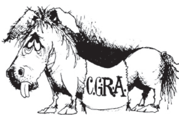
The logo of the Comstock Gay Rodeo Association depicted a broken down horse which came from the stock the Silver Dollar Court could obtain for the first rodeo in 1976.