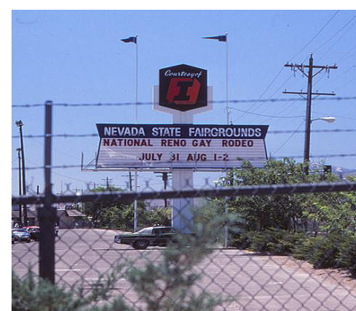
The site of the National Reno Gay Rodeo held at the fair grounds on North Wells Ave.

more than 10,000 people attended the Reno National Gay Rodeo. With the end of the Reno Gay Rodeo, the IGRA (International Gay Rodeo Association) was created in 1985. Today IGRA hosts 10 rodeos and World Finals through its 19 Associations. The site current is non on any register.