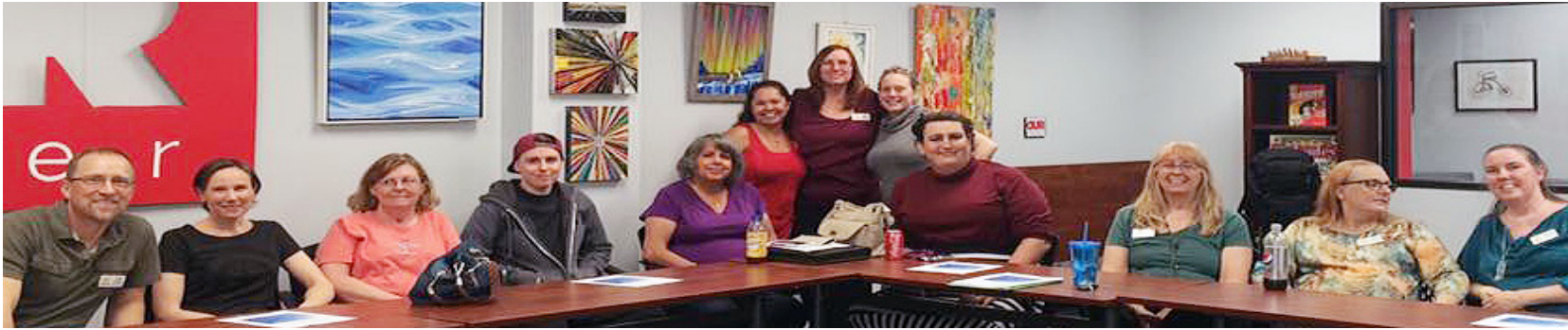
P-FLAG Reno/Sparks Chapter now meets monthly at the Center