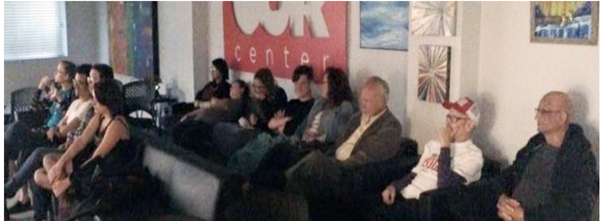
Movie Night at the Center the first Friday of each month at 7 pm