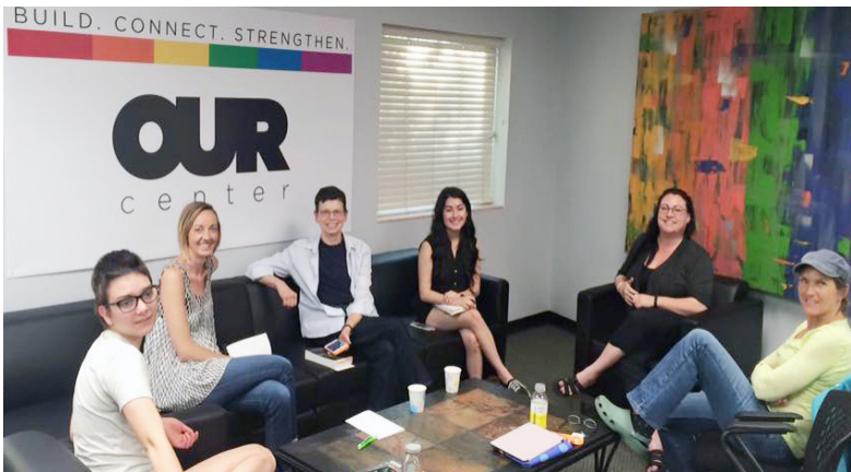
Lesbian literature and history discussion group

main forms of information dissemination for OUR Center.