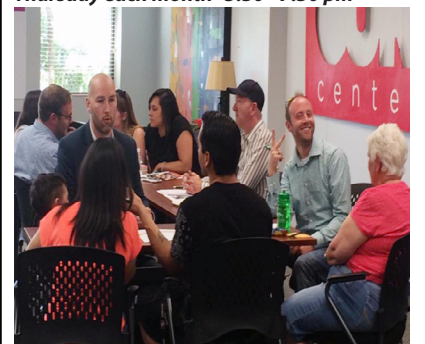
First Homeowner Q and A at the Center for those possibly buying a home